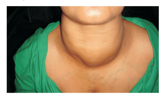
Figure 1. Preoperative anterior view of patient's neck.

A 38 yr old moderately built female patient diagnosed as a case of multinodular goitre with retrosternal extension into superior mediastinum was scheduled for total thyroidectomy and excision of retrosternal extension by cervical route as a planned procedure. She had a history of swelling in front of neck since 15 years. She had history of difficulty in breathing in supine position, exertional breathlessness NYHA grade 2 and cough with expectoration. Clinical examination revealed facial puffiness, dilated veins over anterior part of chest and neck. There was a diffuse swelling in the anterior part of neck measuring about 23 x 11 cms extending from thyroid cartilage above to beyond the suprasternal notch below and laterally upto behind the sternomastoid on both sides. (Figure 1,2)