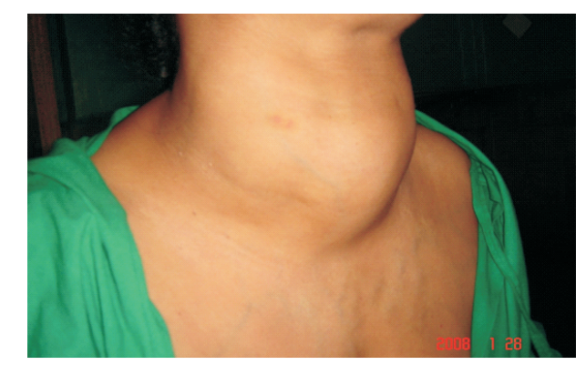
Figure 2. Preoperative lateral view of patient's neck.

All basic investigations, ECG, 2D-ECHO, thyroid function tests were within normal limits. Indirect laryngoscopy (IDL) revealed normal structure and function of the vocal cords. CT scan of chest showed thyroid enlargement with left lobe of thyroid extending downwards upto arch of aorta into the anterior mediastinum. The left lobe of thyroid appeared to be mildly compressing the trachea and displacing it towards right at C7-T1 level (Figure 3).